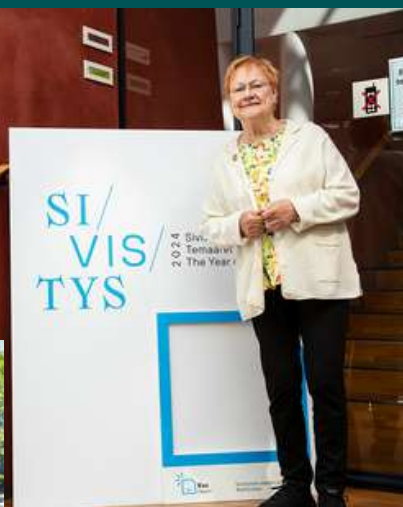
Tarja Kaarina Halonen, former President of Finland