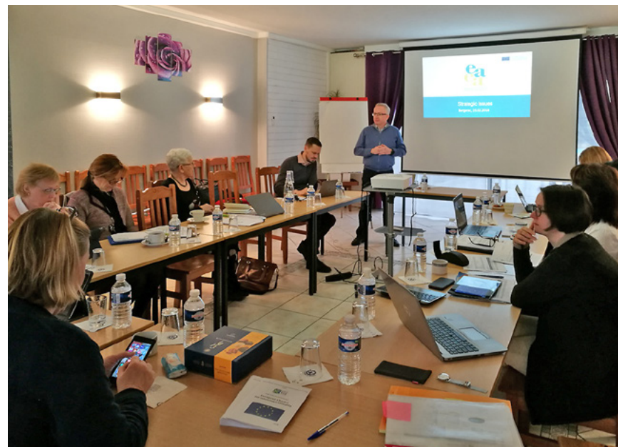
EAEA Board meeting in Bergerac.