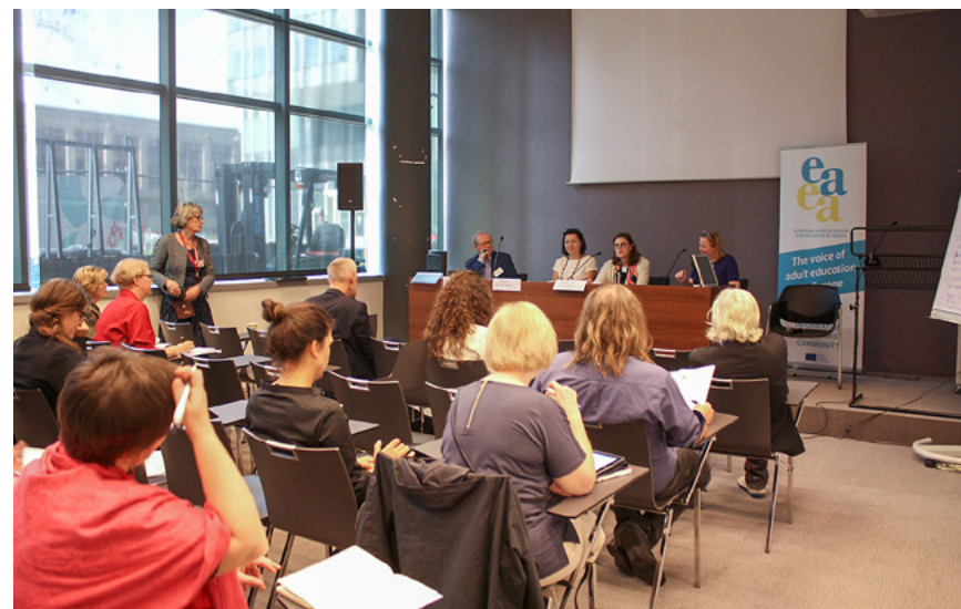
EU policy representatives speaking at the ImplOED event.

principles, transforming lives and societies. A panel discussion looked at the implications for the policy level. The conference also brought forward the voices of learners and educators, who shared their own personal and professional stories.