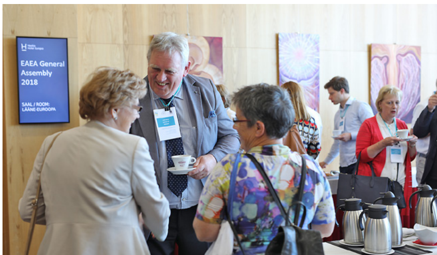
EAEA General Assembly 2018.

The General Assembly of EAEA members, which is the main decision-making body of EAEA, met on 27 June in Tallinn to discuss and approve the EAEA financial and activity reports in 2017 and the plans for the year ahead.