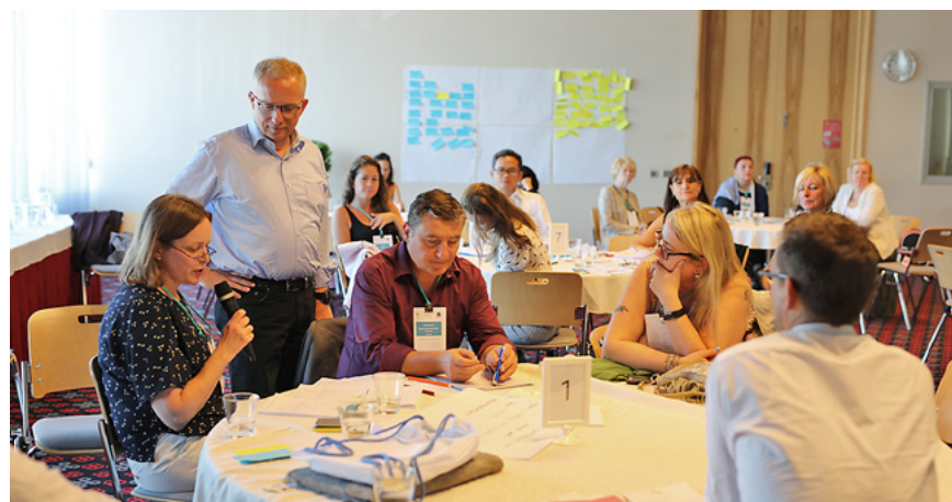
World cafe at the annual conference.

A series of thematic workshops explored cooperations with businesses, bottom-up cooperations, cooperations for democracy and to implement the Upskilling Pathways. The world cafe discussions, moderated by EAEA members, continued the conversation to gather strategic recommendations for EAEA work.