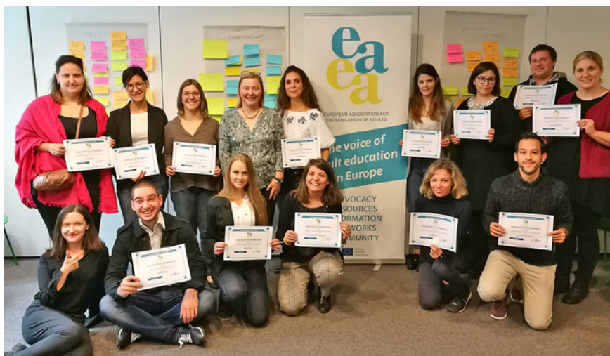
Younger staff training participants of 2018.

“ It is truly a hands-on experience that gives you a very comprehensive picture of adult learning and the good practices from other countries. ”