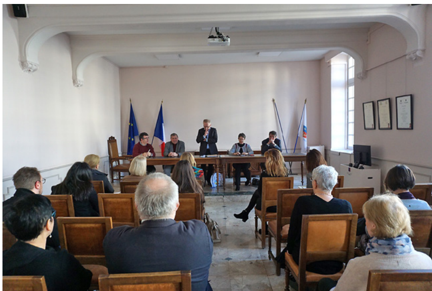
In 2018 EAEA Board met with the mayor of Bergerac.

EAEA's key role is monitoring EU policies, providing feedback and