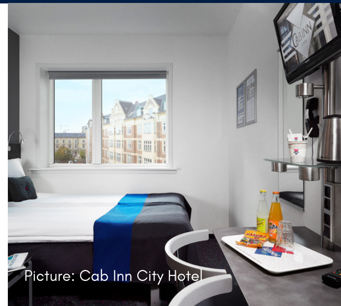
Picture: Cab Inn City Hotel