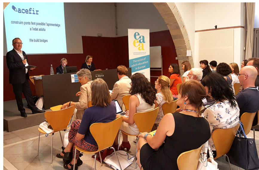
EAEA President Per Paludan Hansen opening EAEA General Assembly.

Katarina Popović, Secretary-General of the International Council for Adult Education, presented updates on the CONFITEA VI mid-term review and discussed the work at the international level with the EAEA General Assembly. Later, the participants split up for the strategic discussion of the association: in workshops, they exchanged on the potential future orientation of EAEA and the role of the European Social Fund for adult education.