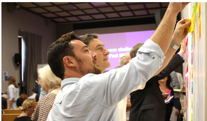
EAEA Annual Conference focused on engaging new learners.

A fish-bowl session at the end brought together the results of the discussions. The conference ended with a performance from a choir made up of refugees and migrants in Girona.