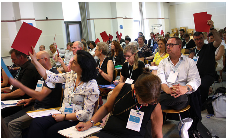
EAEA General Assembly 2017 was held in Girona and was hosted by ACEFIR.

Each of the winners received a piece of art from Girona: miniature versions of letter sculptures in the centre of Girona, which were handed over by the mayor of Girona Marta Madrenas I Mir during a ceremony in the Municipal Theatre of Girona.