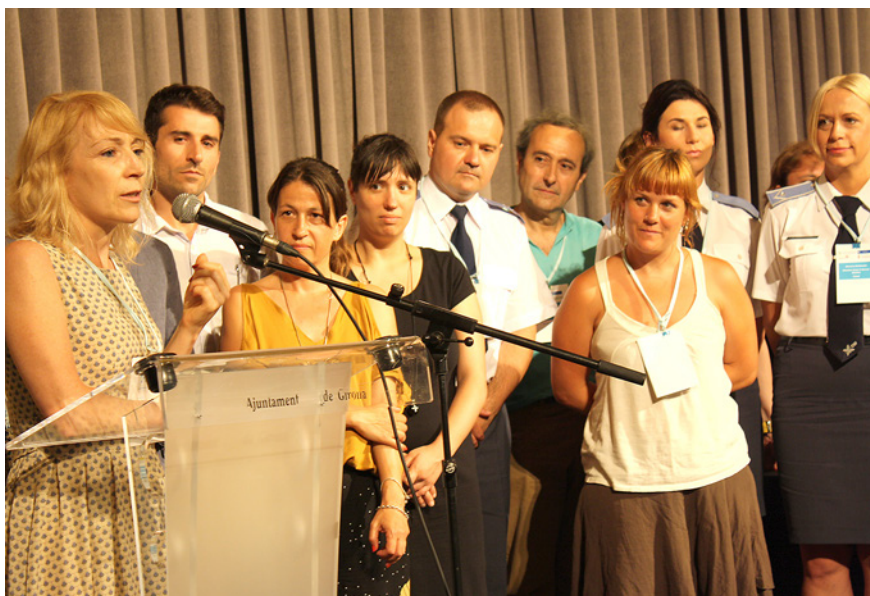
Second Chance project partners receiving the award.

The results of the winning projects were promoted during the marketplace at the conference, attended by over 120 participants. The best practices in engaging new learners were also promoted through an article series presenting the nominees, published on EAEA website and social media. All projects were included in the Grundtvig Award brochure, published in September 2017.