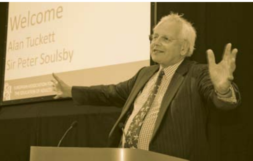
The EAEA Grundtvig Award 2013 Ceremony was hosted by Mr Alan Tuckett, the President of the International Council for Adult Education (ICAE).

In 2013, EAEA was looking for projects that tackle a specific aspect of civic learning: Active citizenship and transnational solidarity – Adult Education as a tool against nationalism, chauvinism and xenophobia . 2013 was the European Year of Citizens and we, as adult educators, saw this as a platform to promote and discuss civic education and active citizenship.